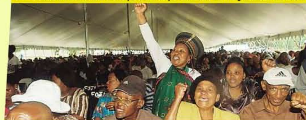
The people of Evaton celebrate the achievements of the ERP.

The completion of the first upgraded houses was celebrated and cheques were handed over to people who sold their land to the Evaton Renewal Project. MEC Nomvula Mokonyane also officially unveiled the upgraded Tshelo Themba Hall and delivered four brand new waste management trucks as a gift from the Department of Housing to the Executive Mayor of Emfuleni, Cllr Assistance Mshudulu. The Evaton Thusong Centre was also launched on the day and everyone enjoyed the party atmosphere and a packed lunch. The programme included speeches, presentations, traditional dancers and local entertainment.