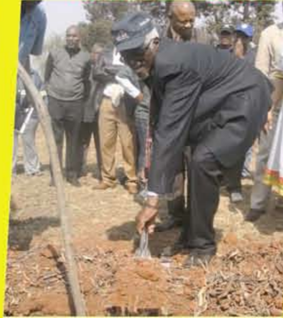
Emfuleni Executive Mayor, Cllr Assistance Mshudulu, planting a tree during the Arbour Week celebration in Evaton. Mayor Mshudulu said that everyone has the right to a clean environment and that schools should encourage learners to plant trees and grow vegetable gardens at home.